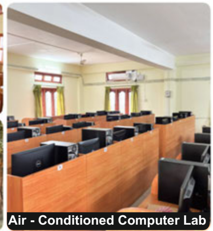
Air - Conditioned Computer Lab