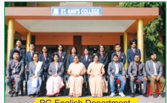
PG English Department