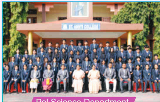
Pol Science Department