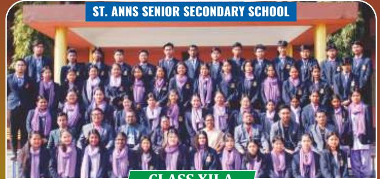
CLASS XII A