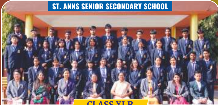
CLASS XI B