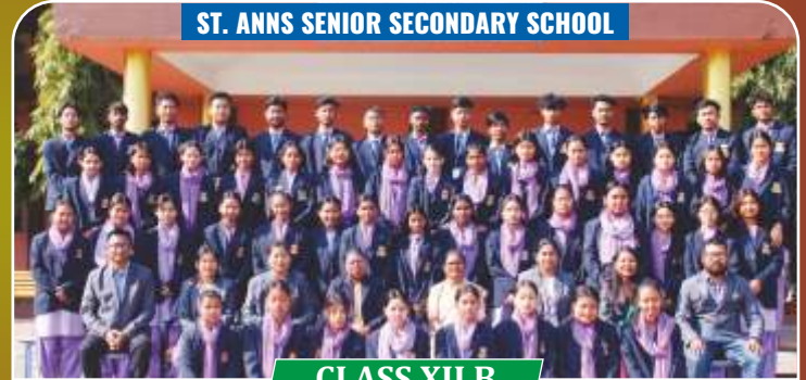
CLASS XII B