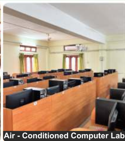
Air - Conditioned Computer Lab