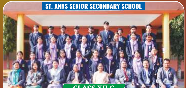
CLASS XII C