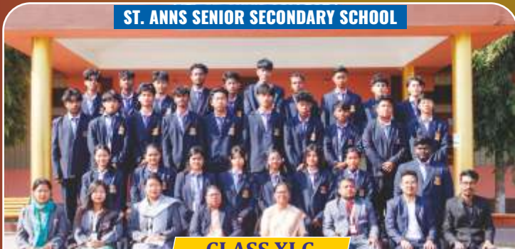
CLASS XI C